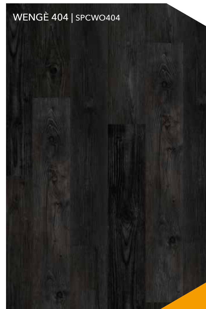
WENGÈ 404 | SPCWO404