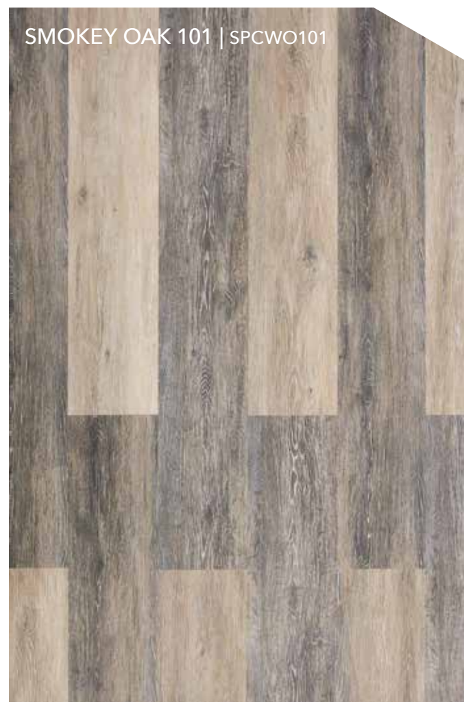
SMOKEY OAK 101 | SPCWO101