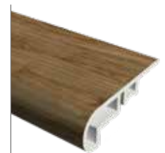
STAIR-NOSE 18x55x2400mm 0,71"x2,17"x94,49"