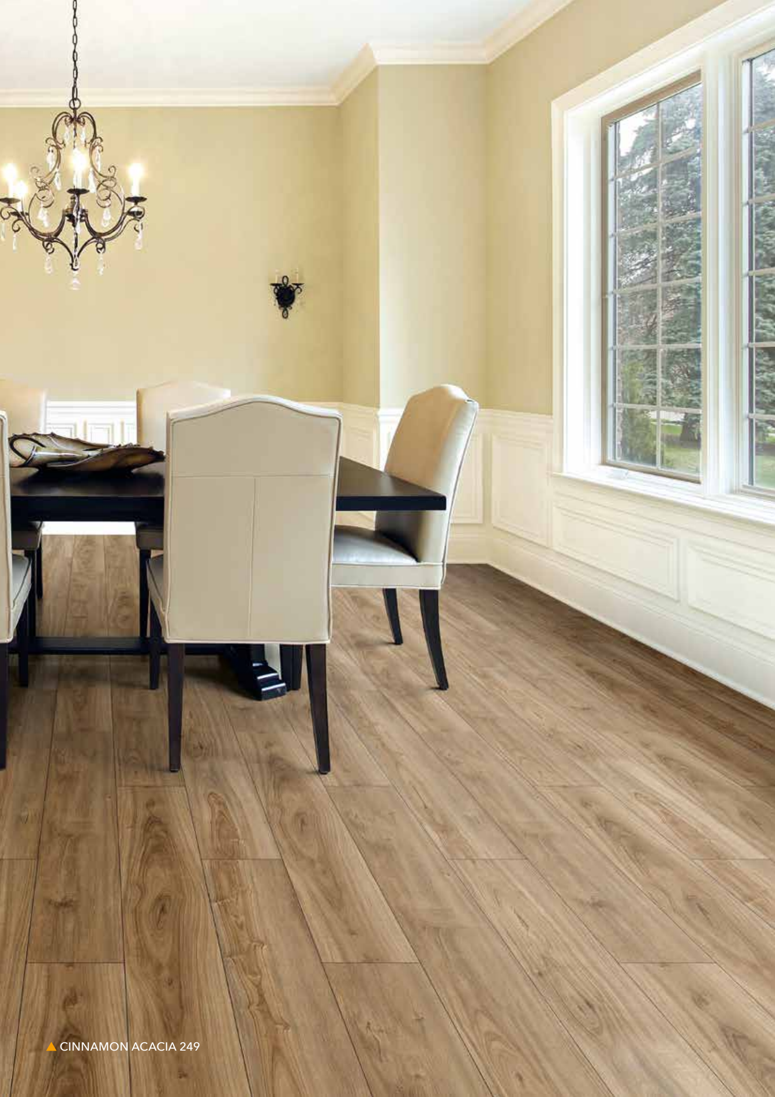
▲ CINNAMON ACACIA 249