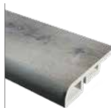
END-CAP 15x26x2400 mm 0,59"x1,02"x94,49"