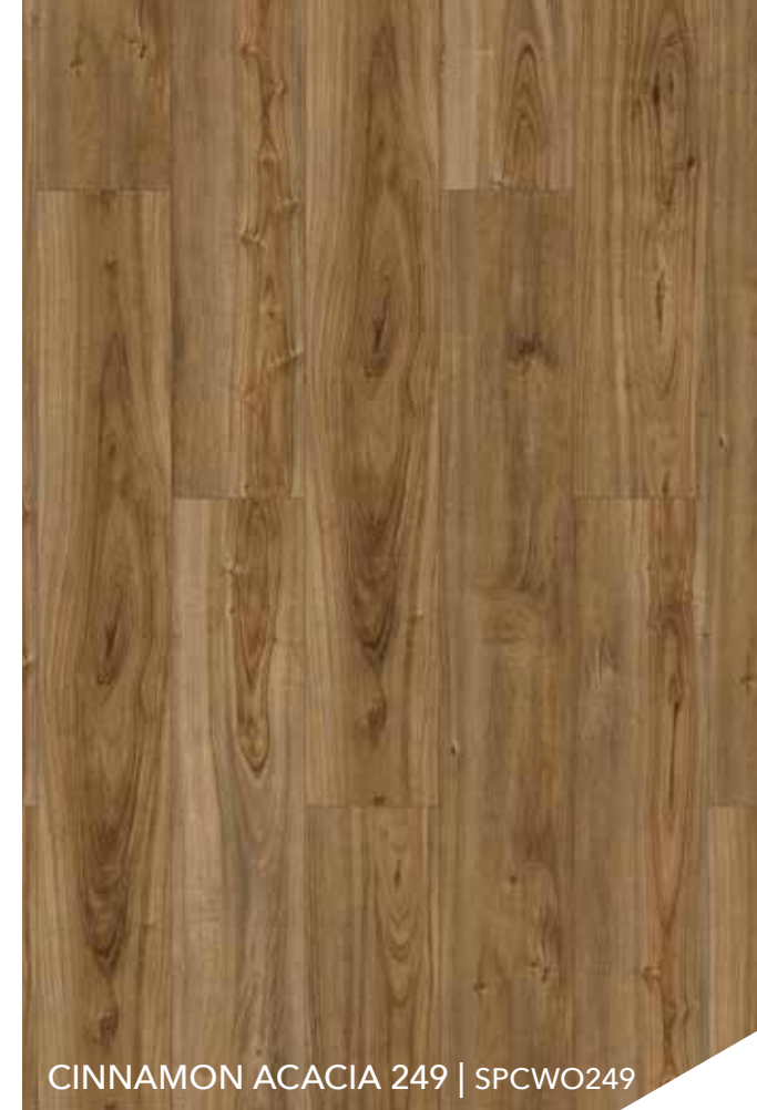
CINNAMON ACACIA 249 | SPCWO249