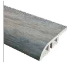
REDUCER 8x45x2400 mm 0,31"x1,77"x94,49"