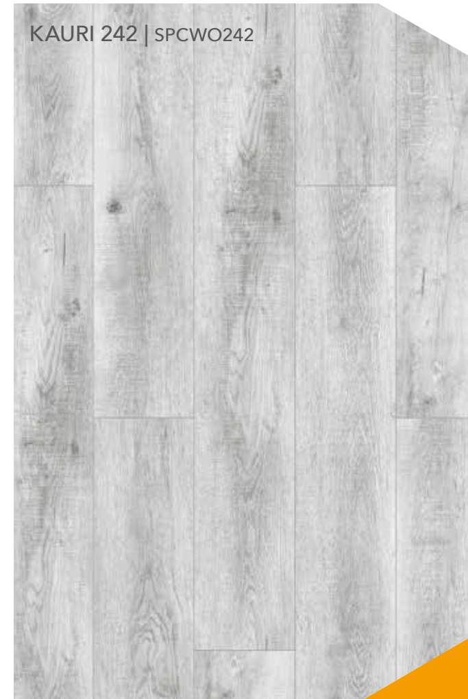
KAURI 242 | SPCWO242