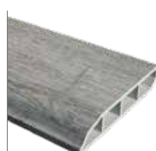
SKIRTING 80 12x80x2400 mm 0,47"x3,15"x94,49"

Material: PVC color film, available also in WPC (Wood-Plastic-Composite) More info: www.spcflooring.it