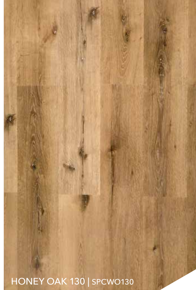
HONEY OAK 130 | SPCWO130