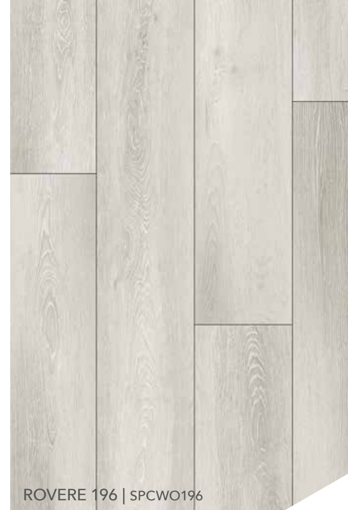
ROVERE 196 | SPCWO196