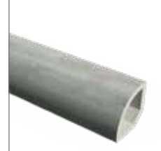
QUARTER ROUND 15x26x2400 mm 0,59"x1,02"x94,49"