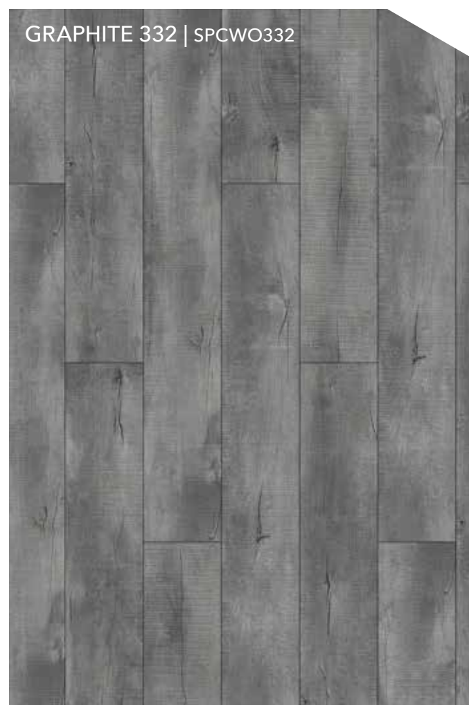
GRAPHITE 332 | SPCWO332