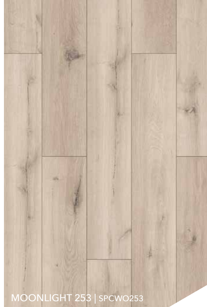
MOONLIGHT 253 | SPCWO253