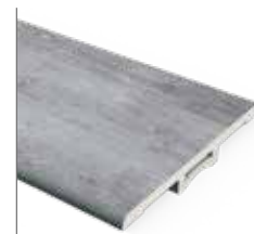
T-MOLDING 8x45x2400 mm 0,31"x1,77"x94,49"